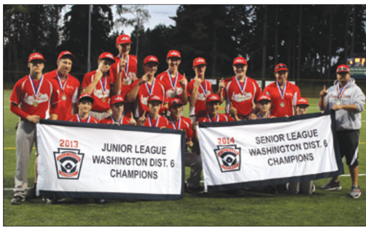
The Lewis River Little League Senior Boys won the District 6 Championship and went on to California for Regionals! As you can see, they were all smiles!!

The National Little League celebrated 75 years in 2014. To top off the season, the Lewis River Little League Senior boys went to California for Regionals. Awesome job! And great support from the community for the team. Congratulations guys!