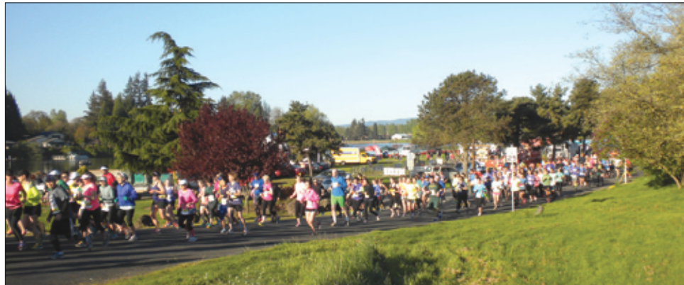
The Second Annual Blooms and Brews Event has grown every year. Next year is expected to have big crowds and be lots of fun!

With music setting the mood, and vendors presenting, the runners were preparing to begin the "flat & fast" course waiting ahead.